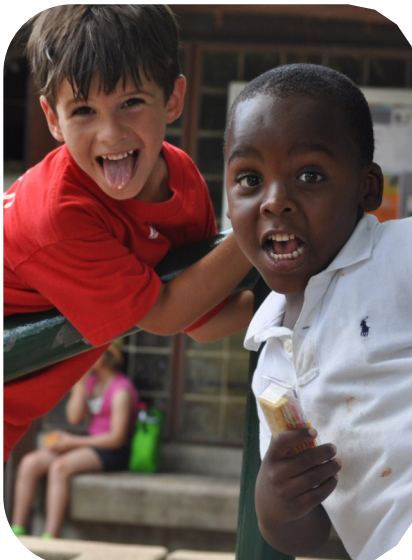
The boys enjoying a day at camp.