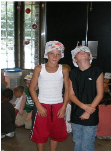
Scenes from Markward Day Camp 2010

Pumpkin the Cat was rescued at least 18 years ago and has been living here at Markward ever since.